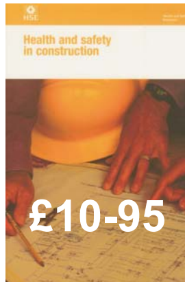
Health & Safety in Construction New Edition 0717661822 HSG150