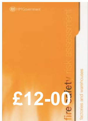
Fire Safety in Factories & Warehouses 9781851128167