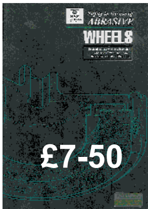
Safety in the use of Abrasive Wheels at Work 0717617394 HSG17