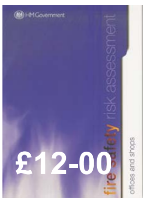
Fire Safety in Offices & Shops 9781851128151