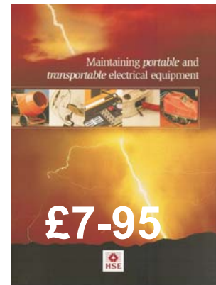
Maintaining Portable & Transportable Electrical Equip. 0717628051 HSG107 2nd Edition

SUPPLIERS OF ELECTRICAL TEST BAYS, ELECTRONIC TEST EQUIPMENT, ACCESSORIES, LABELS, SIGNS, IEE PUBLICATIONS, HMSO & HSE PUBLICATIONS, TAGGING & RECORDING SYSTEMS, SCAFFTAGS, BS CALIBRATION SERVICE, SOCKET TESTERS