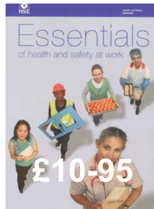
Essentials of Health & Safety at Work 4th Edition 0717661792