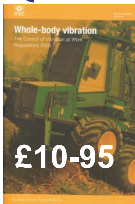
Whole-body Vibration 0717661261 L141