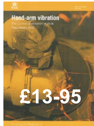
Hand-arm Vibration 0717661253 L140